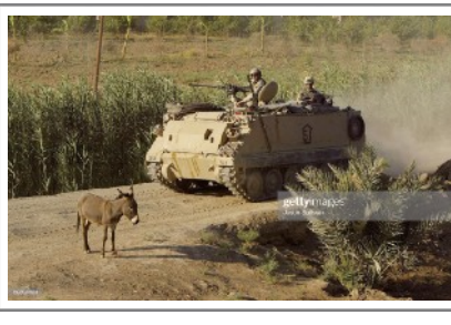
Right: A Co M113A3 armored personnel carrier passes a donkey while on patrol May 25, 2004.