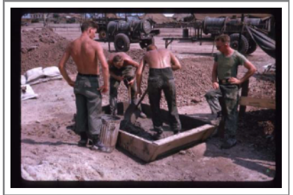
Left: A Co Vietnam '65-'66.