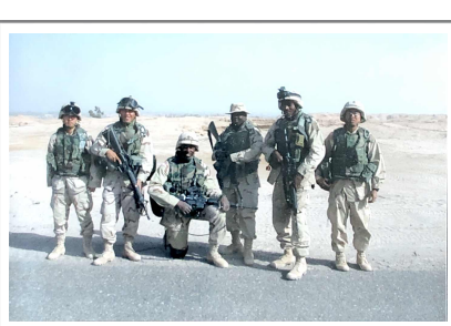
Right: Soldiers from DECON Platoon. DECON was attached to HHC during OIF 2003-2004 and conducted missions such as escort, route patrols, and QRF.