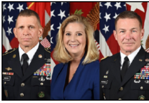
SENIOR LEADER BIRTHDAY MESSAGE