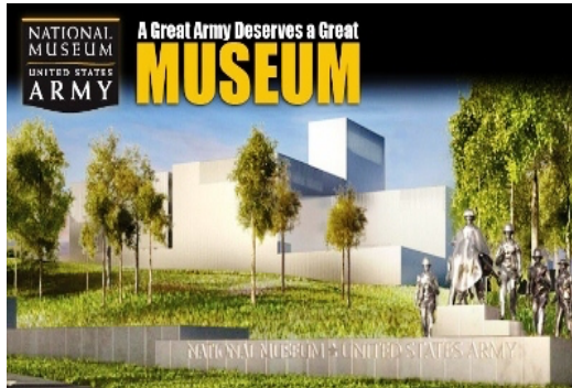
Museum of the US Army