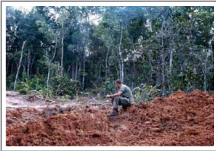
Left: Captain Crowther C CO '66-'67.