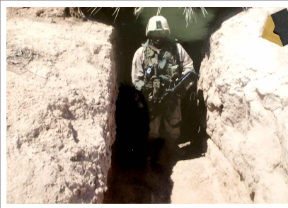
Right: 1EN BN Soldier inspecting a tunnel in the vicinity of Ar Ramadi, Iraq '03-'04.