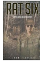
RAT 6 P. 4