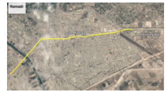
ROUTE MICHIGAN P. 6