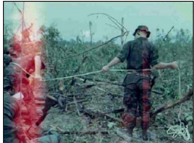
Flowers lowering Gonzalez down a vertical shaft