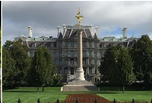
1st Division Memorial

Our reunion will be held at the Hilton Washington Dulles International Hotel just minutes from Dulles International Airport and close to both the Army Museum at Ft Belvoir and Washington, DC.