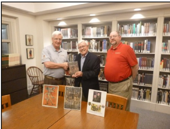
Flowers at a book signing.